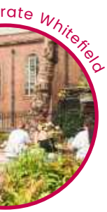
Enhance existing green spaces and introduce projects like community gardening