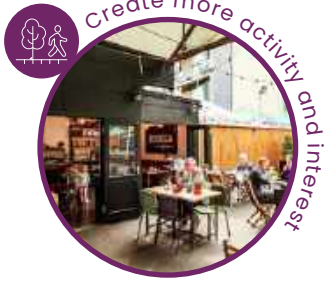
Create a range of events and activities for all ages