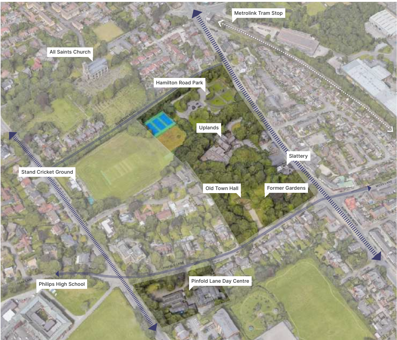
Priority Area - Whitefield Common - Location Plan

The area is located to the west alongside Bury New Road, and is roughly bound by Hamilton Road to the north, Bury New Road to the east, Higher Lane to the west and Pinfold Lane to the south. It comprises a cluster of sites adjoining each other that are either established and well-recognised (Slattery), public spaces that have the potential to be improved (Hamilton Road Park), or currently underutilised sites (former gardens of Whitefield Town Hall).