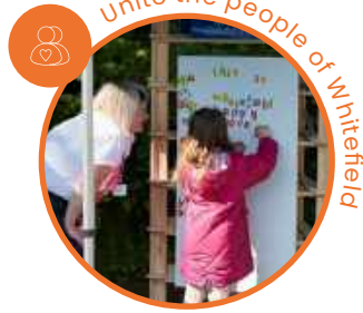
Create spaces where the community can come together