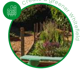
Enhance existing green spaces and introduce projects like community gardening