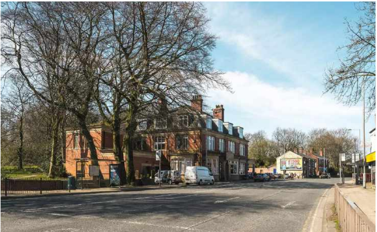
Slattery independent bakery and patisserie

It is intended that Stage 2 will be focussed on the long term, and will address the future strategic transport proposals along the A56 Corridor.