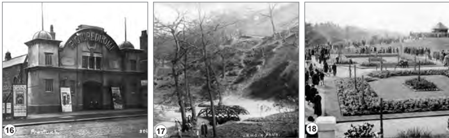
16) The Picturedome, Bury New Road.

Following the building of the new rectory in 1923 on a site next to the Parish Church, the Victorian rectory was demolished and replaced with council housing. The Rector, Canon Cooper, was instrumental in the preservation of a large area of former glebeland as public open space.