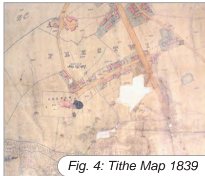
Fig. 4: Tithe Map 1839

Access to the hamlet had formerly been via Bury Old Road, Ostrich Lane, Bent Lane and Back Lane. The new road to Bury was turnpiked to cater for the horse-drawn traffic of the expanding Lancashire cotton trade.