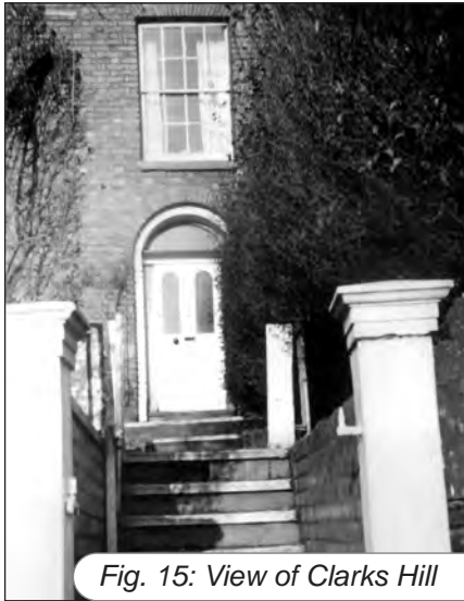
Fig. 15: View of Clarks Hill

Beech Tree Bank on Rectory Lane was originally two pairs of large semi-detached villas built in 1881 in an Italianate style with noteworthy decorative brick work. The well for this area was enclosed within an arch in the stone boundary wall.