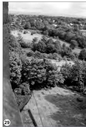
28) Eagle and Child