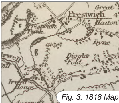
Fig. 3: 1818 Map

The creation of a new road from Manchester to Bury in 1826 affected routes that had been established in the centuries since the Roman road from Manchester to Ribchester fell into disuse. Settlement in Prestwich centred on the area to the north of the line of Church Lane and Clarks Hill, where Wash Lane (now Clifton Road), Greengate and Back Lane (now Rectory Lane) enclosed a hamlet of cottages, with its own school and police station, two farms and, from 1826, a small cotton mill (Figs. 3 & 4).