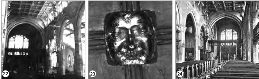
22) Interior of St. Mary's Church (photo by I Pringle).

Substantial fragments of carved sandstone are preserved in the yard at the rear of the Church Inn. These correspond with remaining sculptural features below the tower parapet. (The tower contains a peal of eight bells, six of which were first cast in 1721, that were broadcast worldwide in 1942 to celebrate the victory at El Alamein.)