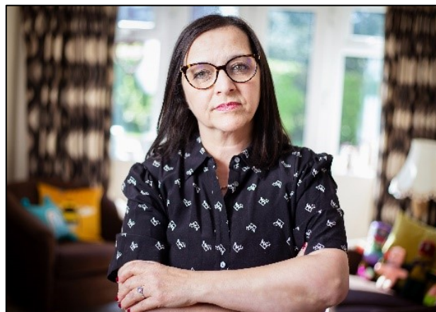
Figen Murray OBE

Hope everyone is well and looking forward to warmer and light filled days.... Spring is on its way!