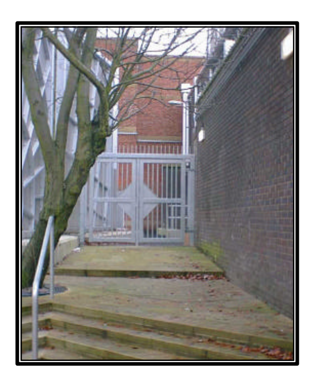
The rear of premises should always be secured

2.27 It is important to emphasise that the rear of a shop unit should not neglected. particular, In reducing the number of windows, ensuring the rear is illuminated and utilising strong doors and locks can go some way towards ensuring a more secure unit. Unauthorised access into and around shop units should be prevented.