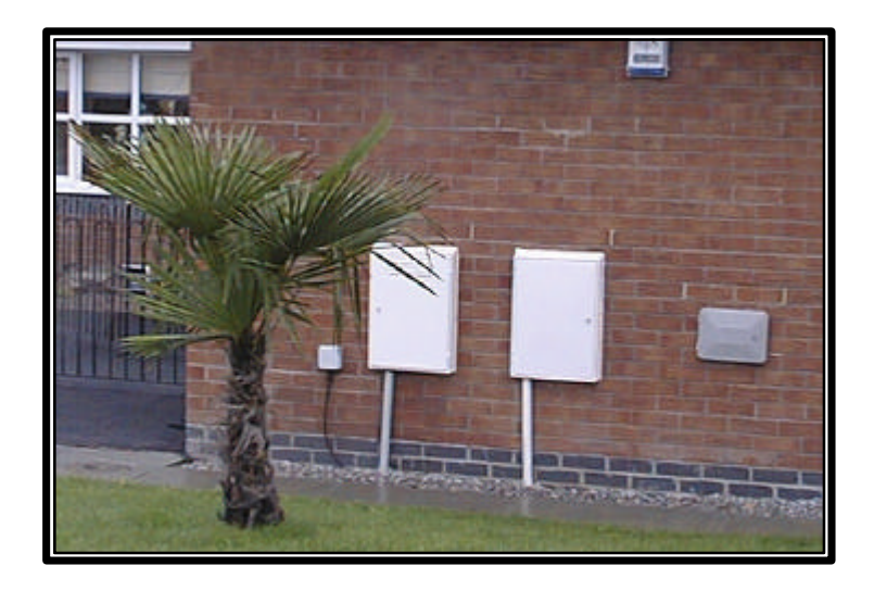
Exposed cables can leave property vulnerable to crime

For further information on target hardening your proposed development, please contact the ALU. Details are provided in Section 6.