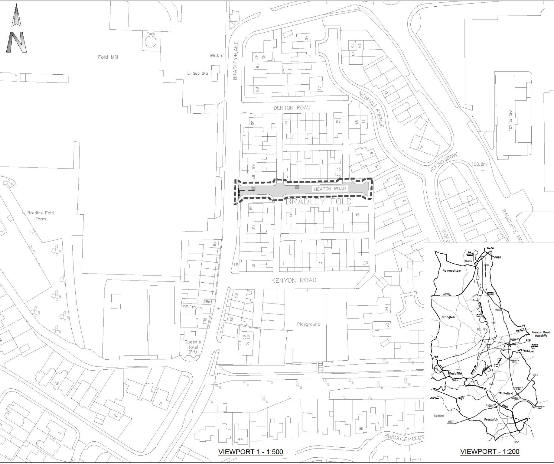
VIEWPORT 1 - 1:500