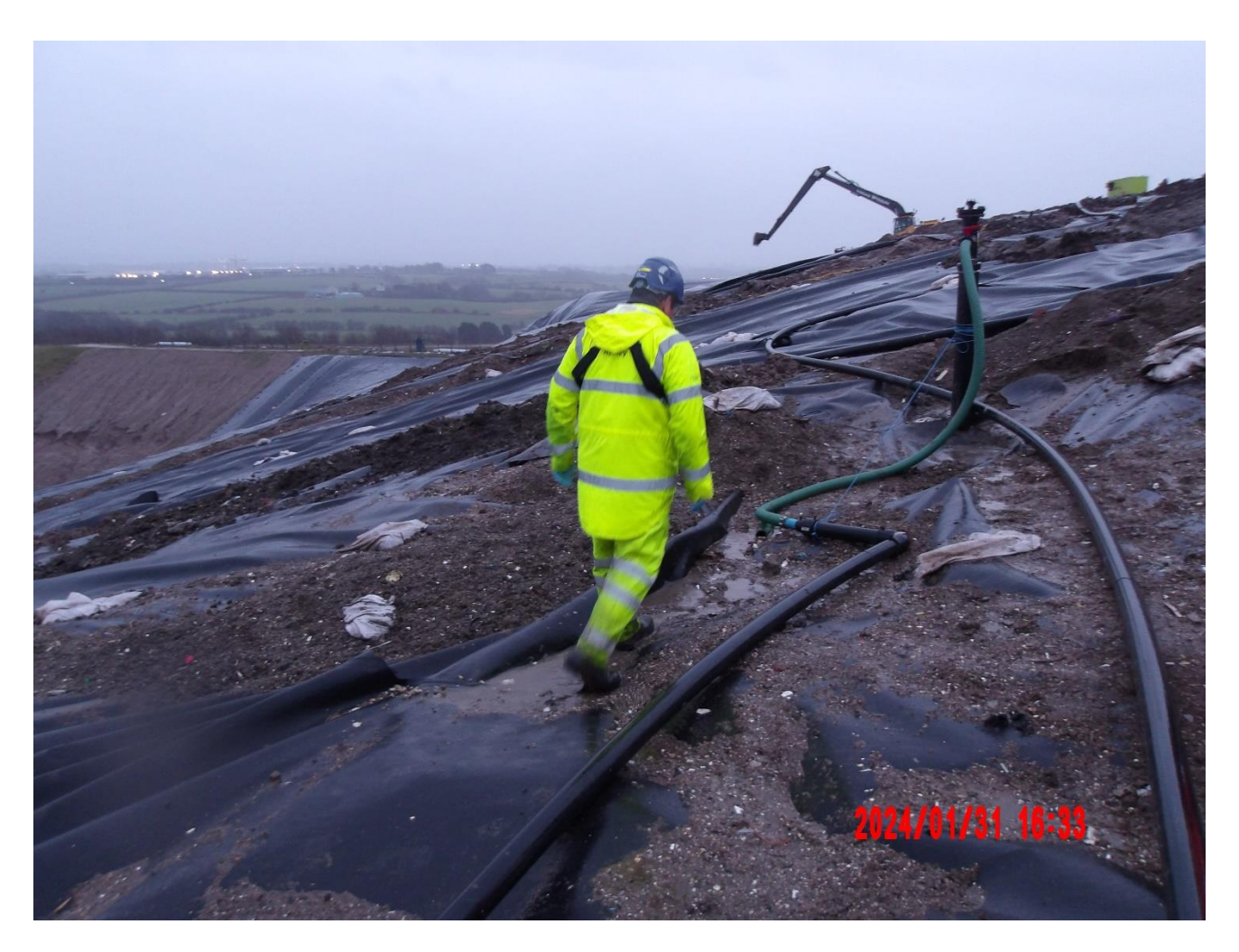
Picture above shows: An Environment Agency landfill officer inspecting the integrity of the capped area and gas management system following increased complaints the day before.

We are also regularly meeting with the UK Health Security Agency (UKHSA), Bury Council and Rochdale Council to keep them informed of our actions and the actions of the operator.