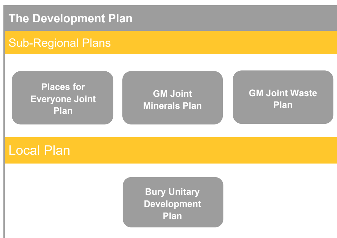
Figure 1 - Bury's Development Plan