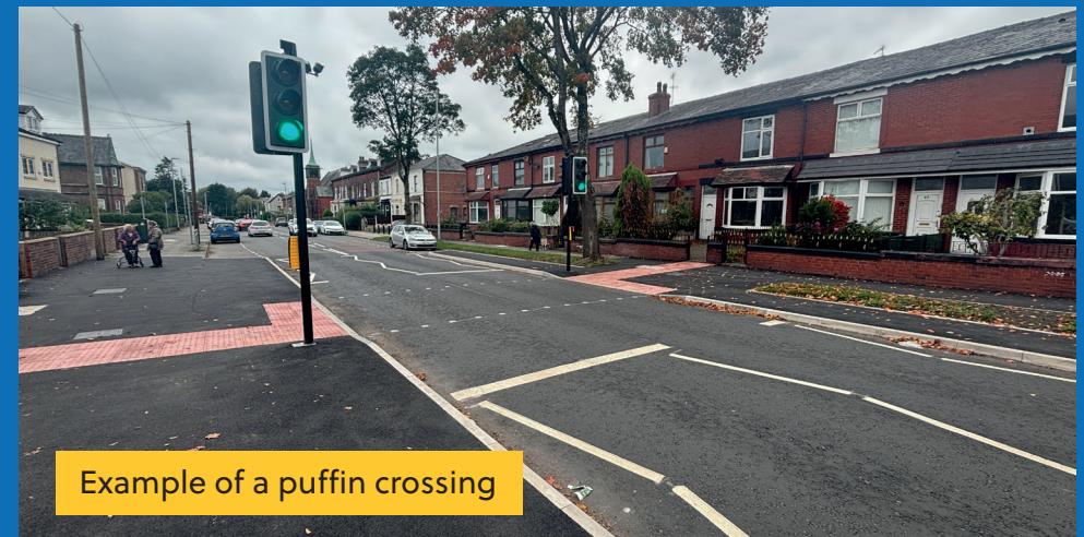
Example of a puffin crossing