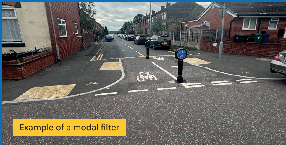
Example of a modal filter