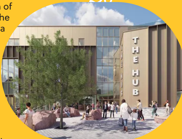
Proposals for a new Civic Hub in Radcliffe

In Radcliffe, the Strategic Regeneration Framework (SRF) was prepared in 2020 and provides a single integrated plan for the strategic regeneration of Radcliffe. It identifies a clear set of interventions and approaches to guide growth and to deliver the town's much-needed regeneration. £20 million of funding has been secured from the LUF towards the development of a new Civic Hub in the town centre bringing together key services and functions at the heart of the town. Other priority projects include the refurbishment of the market's basement for new uses including events space, refurbishment of the Market Chambers building, new leisure facilities, a secondary school, new housing, active travel, better links to the Metrolink and new car parking.