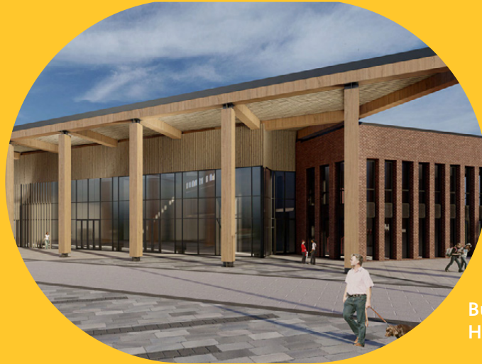
Bury Market 'Flexi-Hall' Proposals