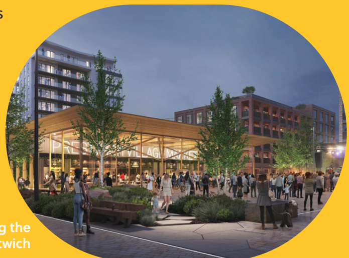
Vision for regenerating the Longford Centre site, Prestwich

Regeneration plans for Prestwich focus on the redevelopment of the Longfield Centre in Prestwich Village through a joint venture partnership with Muse Developments. This will include new and enhanced civic and health related services, new commercial units to meet modern demands and uses, increased residential development, improved active travel provision, public realm and placemaking. It also aims to maximise transport connectivity between Prestwich Village to other parts of the borough and to Manchester via bus and tram links.