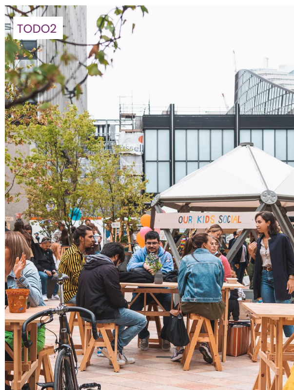
Sadler's Yard, Manchester