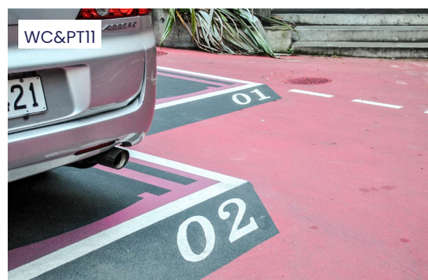
North New Zealand