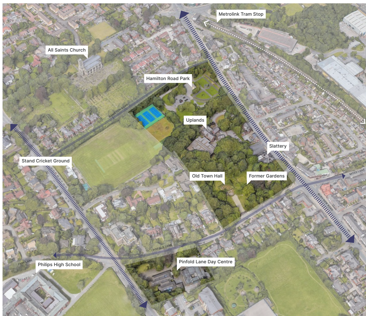
Focus Area - Location Plan

The area is located to the west of Bury New Road and stretches from Hamilton Road Park to Pinfold Lane and includes the former library and Pinfold Day Centre