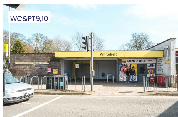
Whitefield Metrolink stop, Manchester