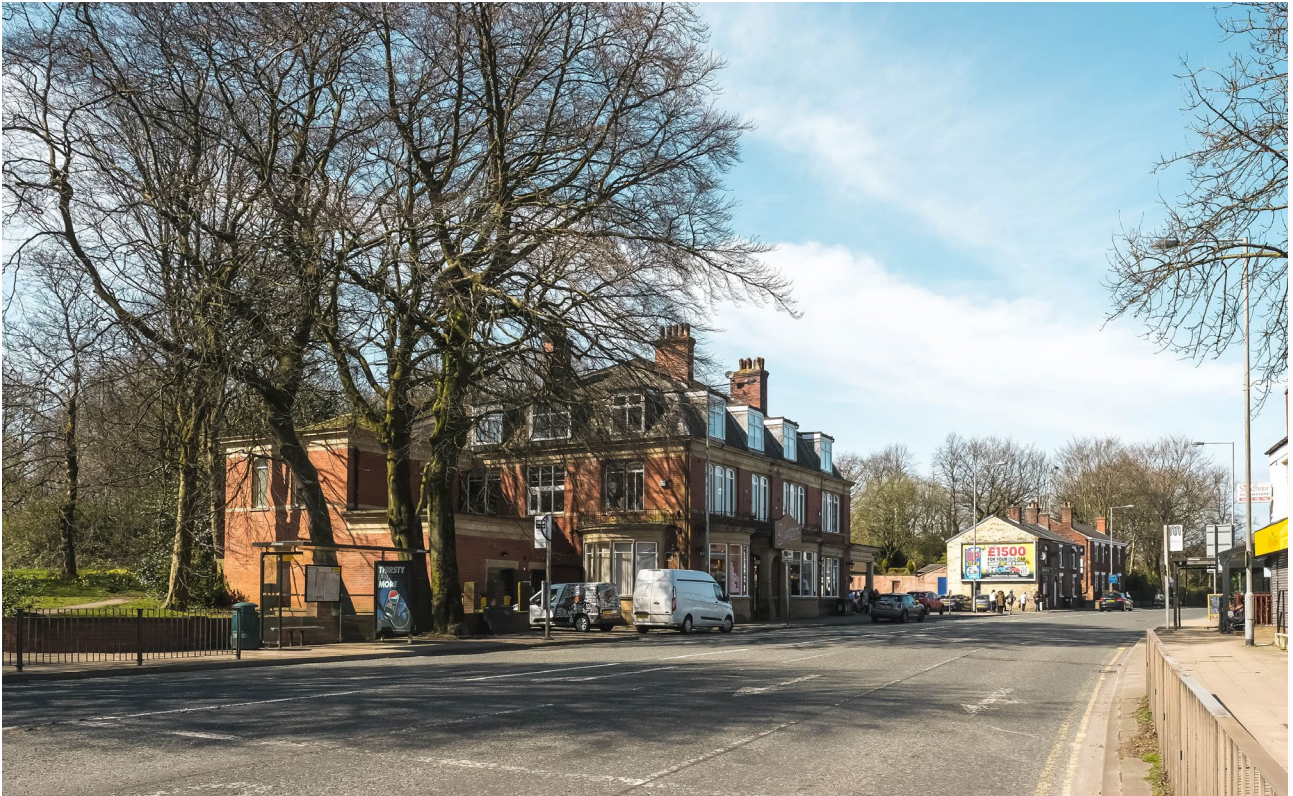
Slattery independent bakery and patisserie

This means we can't make quick decisions about Bury New Road without looking at the bigger picture of traffic in the region.