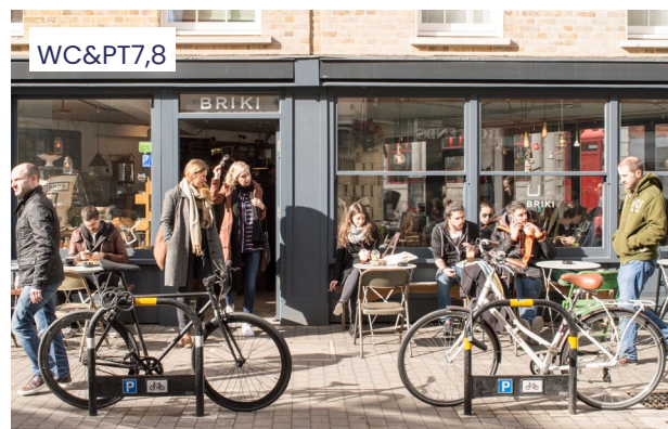
Well-integrated cycle parking, London