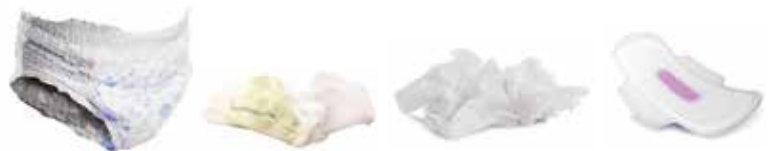
Nappies and hygiene products (in a tied bag)