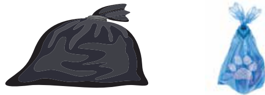
Bagged waste and pet waste