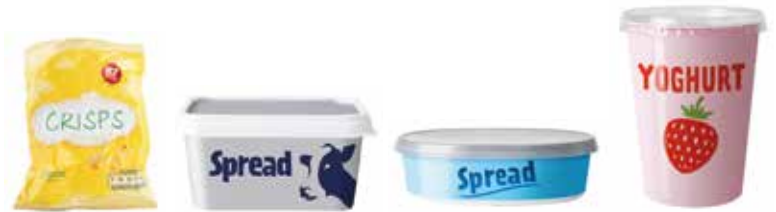
Plastic packets, pots and tubs