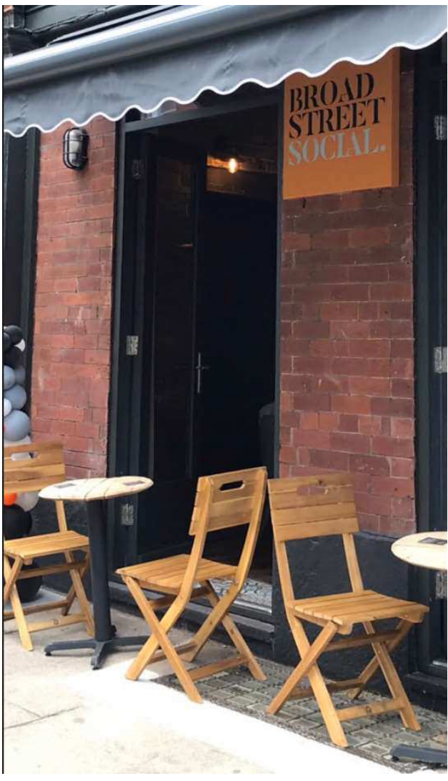
TM8/20/63 Broad Street Social, 9 Broad Street, Bury Part 1 of the Business and Planning Act 2020 and amended by the Levelling Up and Regeneration Act 2023.